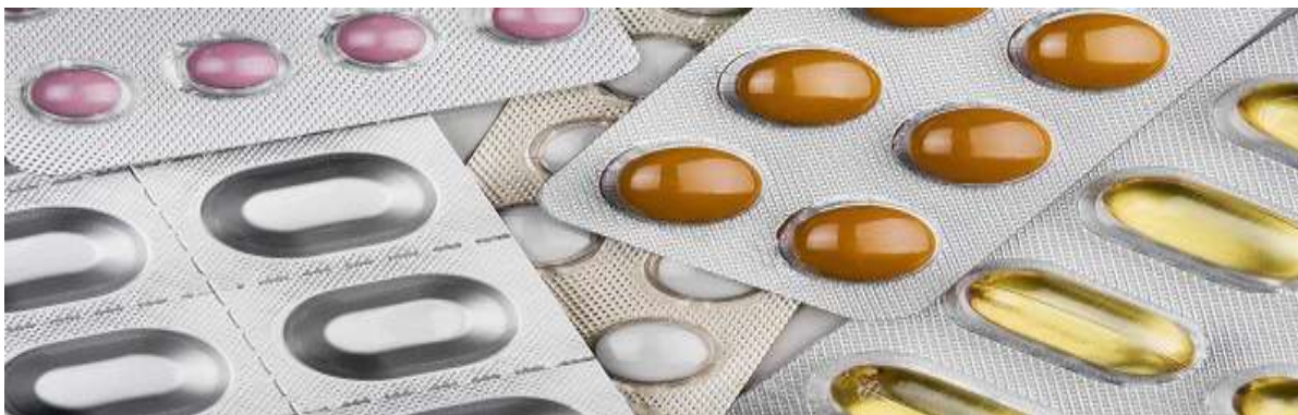
Fig.1. Blister pack

Blister packaging is mainly made from base layer (PVC) which hold the pharmaceutical product in its cavities, it provides better protection as compared to strip packaging. The aluminum foil or paper used as a lidding material. The lidding material and a base layer of PVC sealed by applying heat and pressure for a particular dwell time known as blister sealing process.