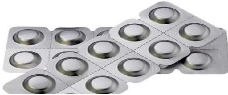
Fig.4. Aluminum Cavities

Aluminum: Aluminum foil is used in such application where more water and oxygen obstruction and long life is required for the product. It is used into cold forming process of blister packaging because of its different points of interest into 3-layers overlay: PVC/Aluminum/Polyamide. The PVC side is within in contact with the product. Aluminum foil has more cost as compared to polymer films.