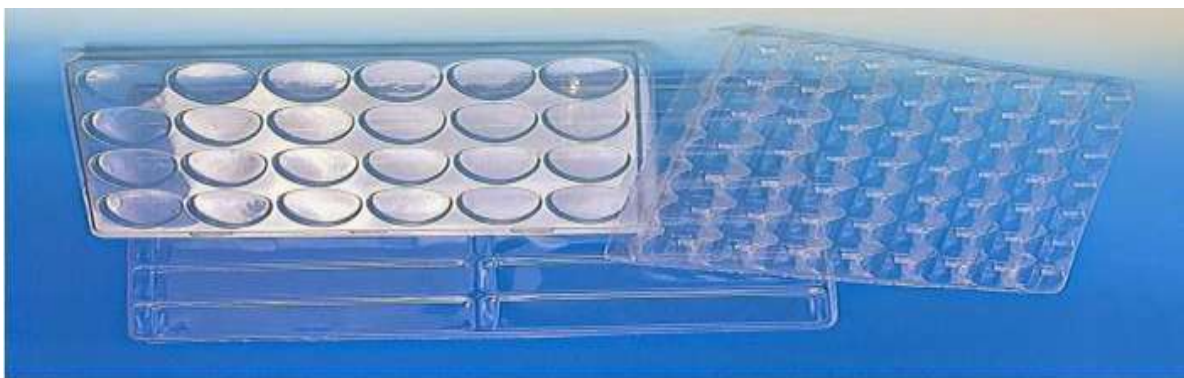
Fig.2. PVC Blister Cavities

Polyvinyl Chloride (PVC): Polyvinyl chloride has good crystal-clear surface and provides good protection from chemical hazards. Polyvinyl chloride has low thermal stability low physical endurance as compared to PET films after but due to its low cost and good barrier properties it is the most widely used material in blister packaging applications of pharmaceutical.